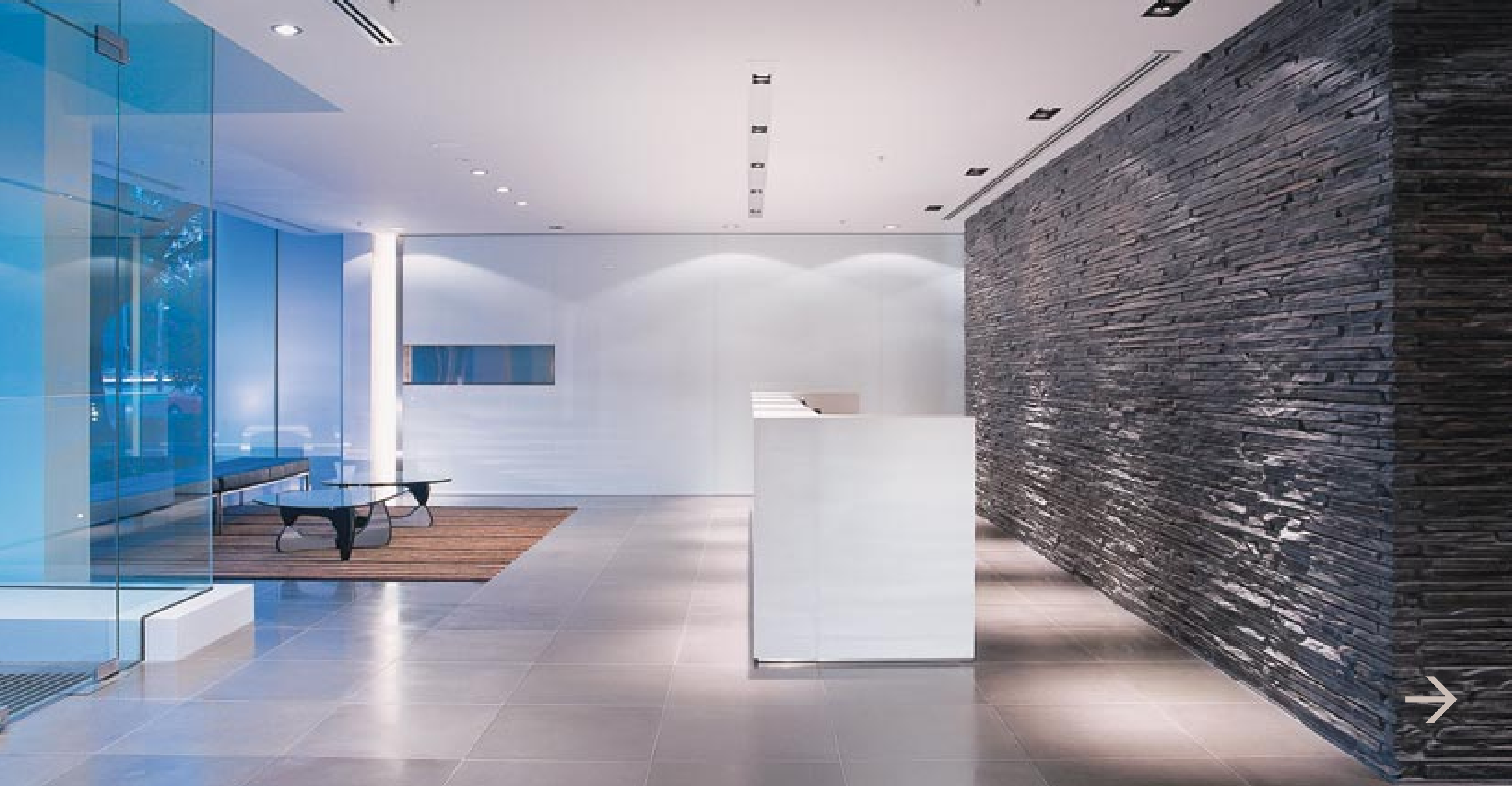
Above ... Colour-back glass feature wall + signage box to main reception area.

“The combination of Schiavello’s partition fitout and the special materials we nominated has ensured an exceptional result. The Millem achieved the design aims that we were seeking,” Alan Synman, SJB Architects.