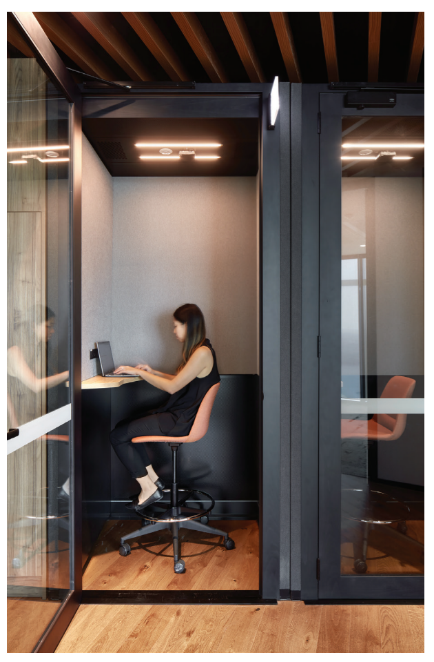
The Focus Quiet Phone Booth providing a place of uninterrupted focus

To fulfil an important requirement for adequate meeting rooms, JLL's fit-out prioritises flexible workspaces through furniture, operable walls and dual purpose rooms. Schiavello's Aire Fold Tables, which can be folded and moved, provide agility in meeting rooms, while operable walls allow the office to easily transform to accommodate gatherings of all sizes. A podcasting and media room converts into a standard meeting room, while the lunchroom doubles as an impromptu collaboration space outside peak hours. By weaving versatility into every facet of the fit-out, the full spectrum of work styles and tasks - including individual assignments, collaborative projects and casual meetings - is supported.