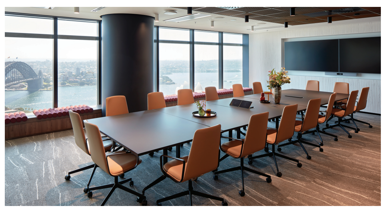
The Aire Fold Table creates an agile boardroom experience