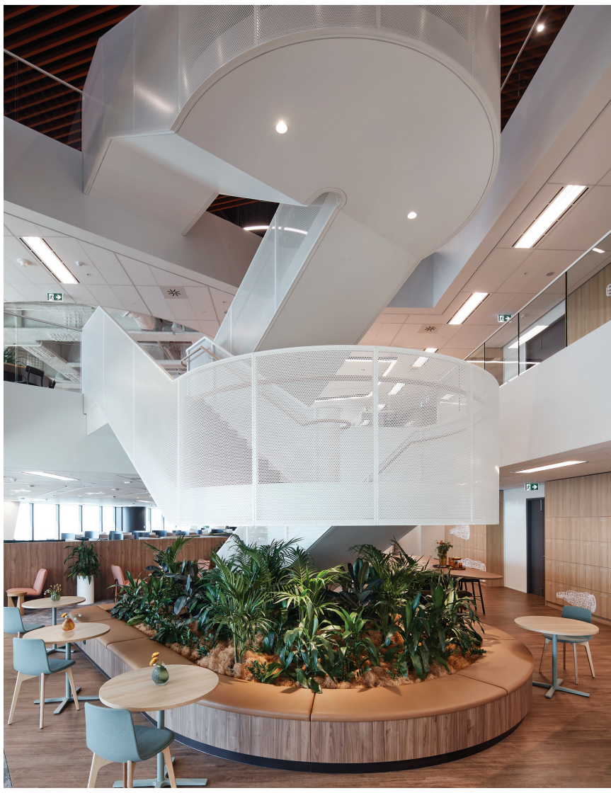
Krossi Tables help to create a warm aesthetic in break out areas

The overarching message from real estate experts, JLL, is that it's not just about the physical environment, it's about the entire employee experience on any given workday; a philosophy that will benefit its clients for many years to come.