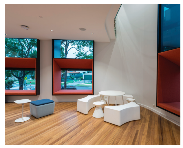
Schiavello Tangier Seating and circular Aire Tables support reflection and casual study in the breakout area.

Nearby, a Blom lounge setting simulates a breakout space in an office environment. Joyful and sculptural, the setting retains a casual and laid-back appeal, providing a place for the students to gather, chat and hold group discussions. The chairs' matching low table creates a sophisticated, uniform aesthetic. With the chair and table's polyethylene form upholstered in fabric, the pieces complement the textured, denim-weave-esque carpet.