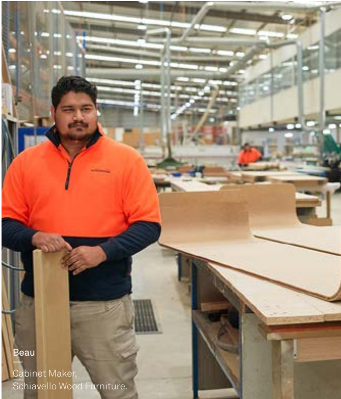
Beau Cabinet Maker, Schiavello Wood Furniture.