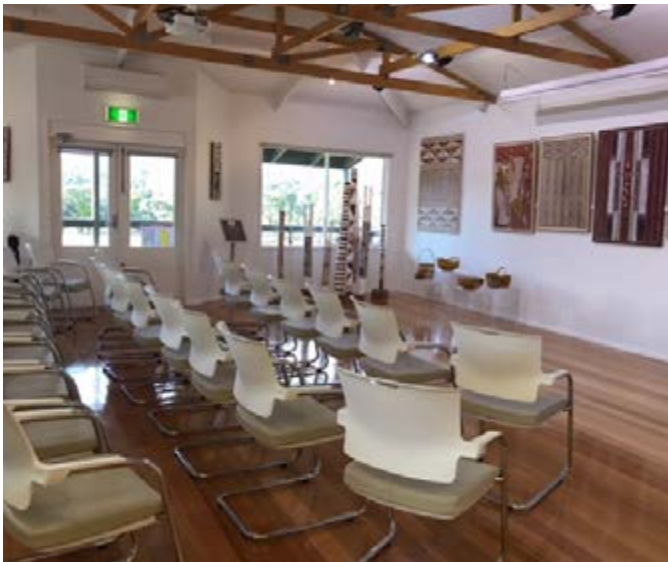
Photo: Donated furniture in Worawa College Art Gallery.

Thoughts have already turned to how best to satisfy the school's next wish list.