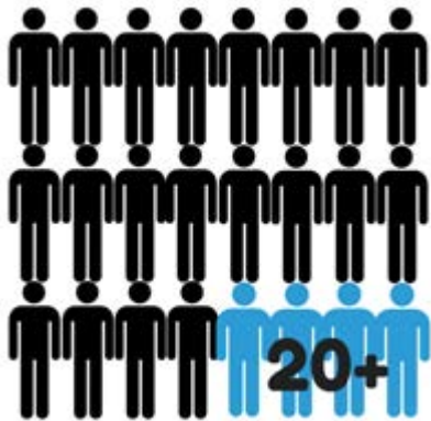
14% of our people boast over 20 years of service

A number of actions will ensure we continue to develop the careers of our diverse workforce. This includes the appointment of a senior Enterprise Talent and Culture Leader in 2015, a Learning and Development Lead in early 2016, and an Indigenous Engagement Manager in January 2017.