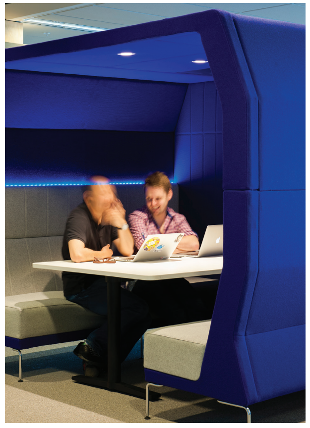
Kayt Cabana in electric blue

Kush Ottomans fill large, soft-furnished spaces, while the high-performance Liberty Mesh Chair is used throughout. Complementing the agile environment are Krossi Tables, Kayt Tables, custom MDF powder coated storage units and Lettric softwiring with USB charging.