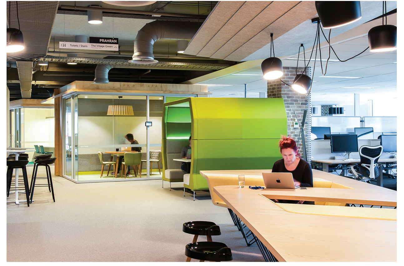
Kayt Cabana in a vibrant lime green