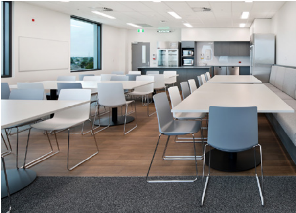
Bespoke kitchen tables and Plaza Seating

Together with colleague Rebecca Molland, a former nurse now working with Schiavello in Brisbane, the Wellness team has developed a foam-based furniture system, structurally sturdy and comfortable, yet so light that harm is minimised if used as a projectile. Drawing on the sound experience of healthcare professionals in our network has led to a more meaningful, practical collection overall. The development of safety-first furniture to suit the specific requirements of a mental health was found to be useful to other wards too, such as dementia.