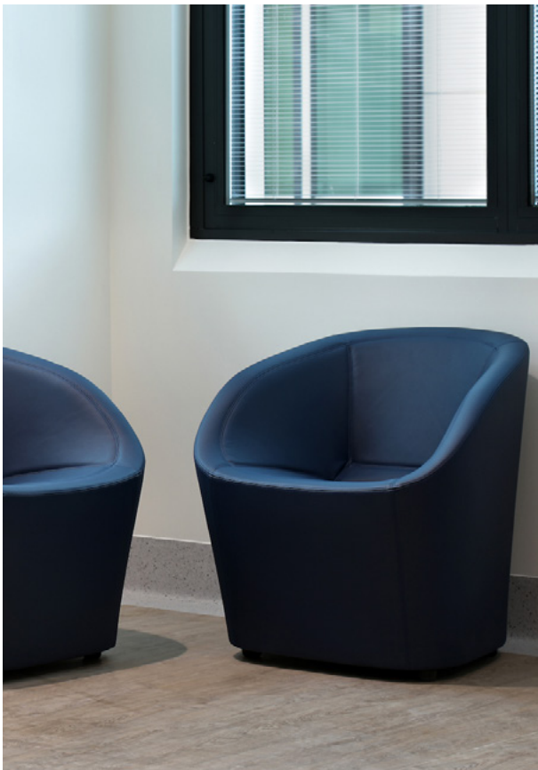
Custom Blom Seating

The tailored responses developed for these leading medical institutions has contributed greatly to our team’s collective understanding of the field, each one an invaluable opportunity to further Schiavello’s research and capability in delivering world-class healthcare design.