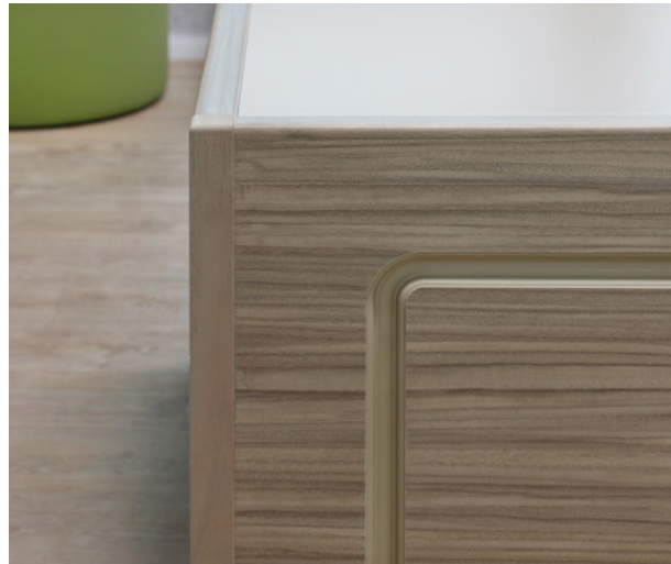
Custom laminate bed base

prevent injury from sharp edges. Fixed to the floor via metal brackets, the robust base comprises a series of interlocking panels, to brace it against any side or top impact.