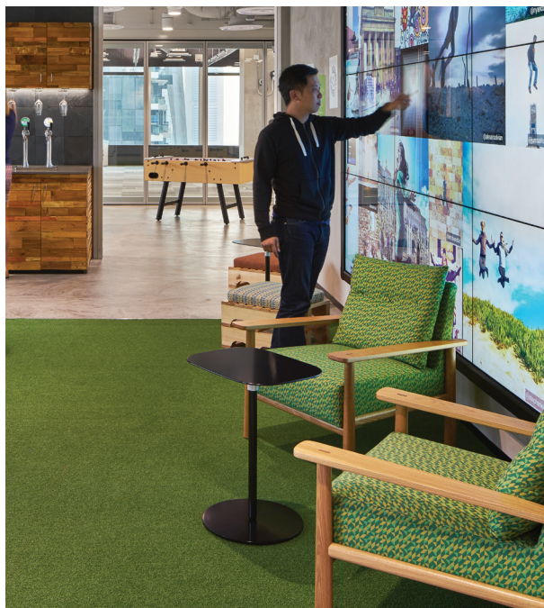
OTM Table for impromptu meetings

The workspace marks the third expansion for Facebook in Singapore alone (along with headquarters in Hong Kong and Seoul), in which Schiavello supplied intelligent furniture solutions in support of Facebook and its people. In spite of the past experience, Schiavello still prototyped and tendered for the project, exemplifying a commitment to pushing the boundaries of customised solutions and service.