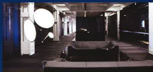
SAATCHI & SAATCHI A BOLD STATEMENT AT WORK, P.092