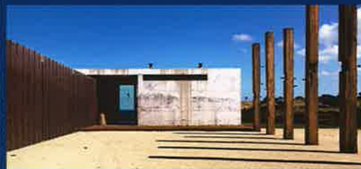
FLINDERS RESIDENCE SCULPTURE BY THE SEA, P.176